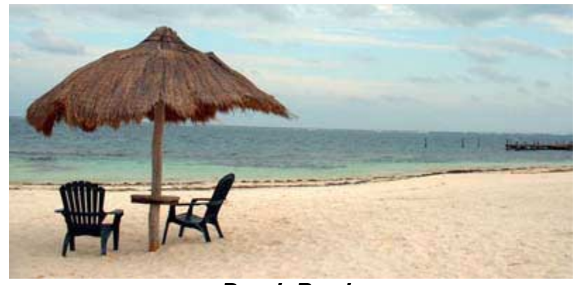
Beach Reads News from Alma Libre Bookstore - Puerto Morelos, Mexico Issue #3 - March 2003