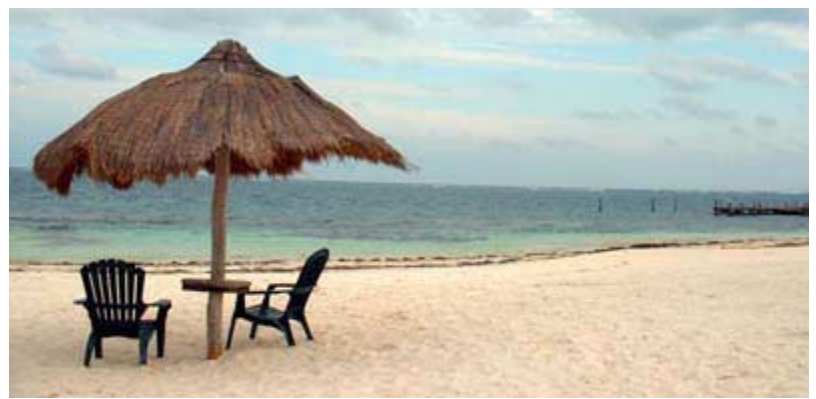
Beach Reads News from Alma Libre Bookstore - Puerto Morelos, Mexico Issue #4 - April 2003

Click here to go to our website: www.almalibrebooks.com