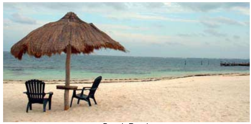
Beach Reads News from Alma Libre Bookstore - Puerto Morelos, Mexico Issue #5 - May 2003

Click here to go to our website: www.almalibrebooks.com